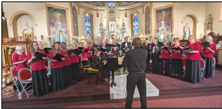
Chopin Singing Society 126 th Anniversary Concert – St. Stanislaus B&M Church – October 2025