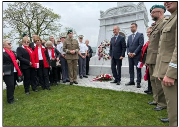
District 7 at Kosciuszko Monument Rededication at West Point and at New York's Pulaski Parade - 2025