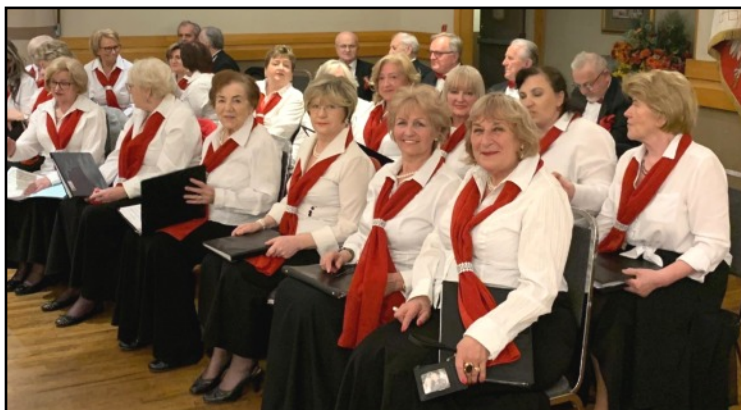
Symfonia celebrating Polish Constitution Day, May 3 rd .