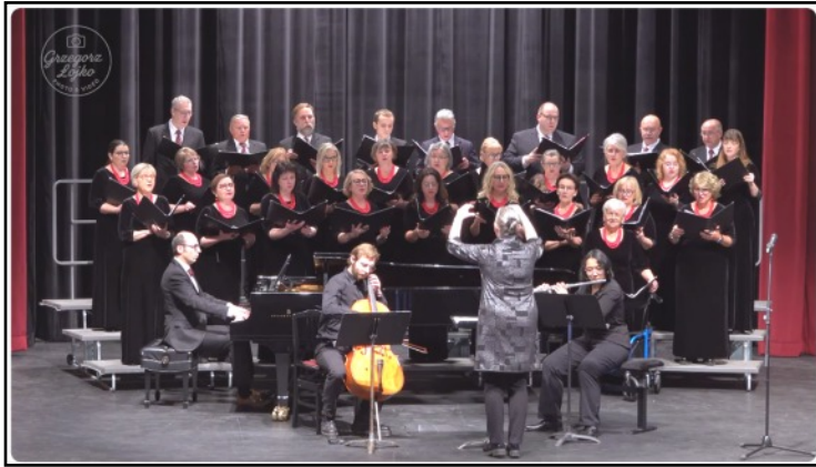
Polonia Choir performing in the Christmas season.