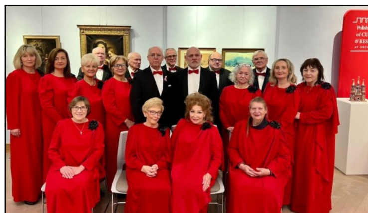
Filarets Choir Concert at Orchard Lake

Lira Ensemble #314 celebrated their 60 th year in 2025. Begun as a small group of singers, it expanded to the song and dance ensemble that continues to thrill audiences today. The Alliance of Polish Clubs hosted the Ensemble in anticipation of Polish Constitution celebration, adding the 1000th anniversary of the Kingdom of Poland on April 27, with additional concerts on April 28 and May 5. In June and July Lira hosted their tours of Poland, one to the North and one to Southern Poland. A special birthday party was celebrated