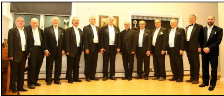
Chopin Singing Society #182 – Passaic, NJ.