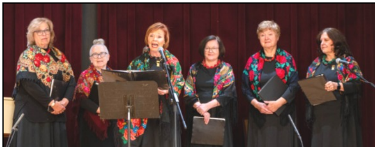
Polish Tango Concert