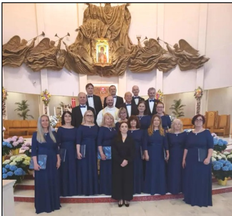
Chor Hejnał at Doylestown Shrine.