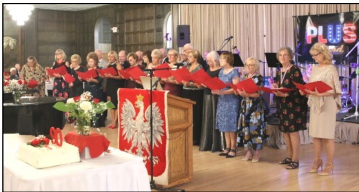
Celebration of the 90th Anniversary of Filarets Choir