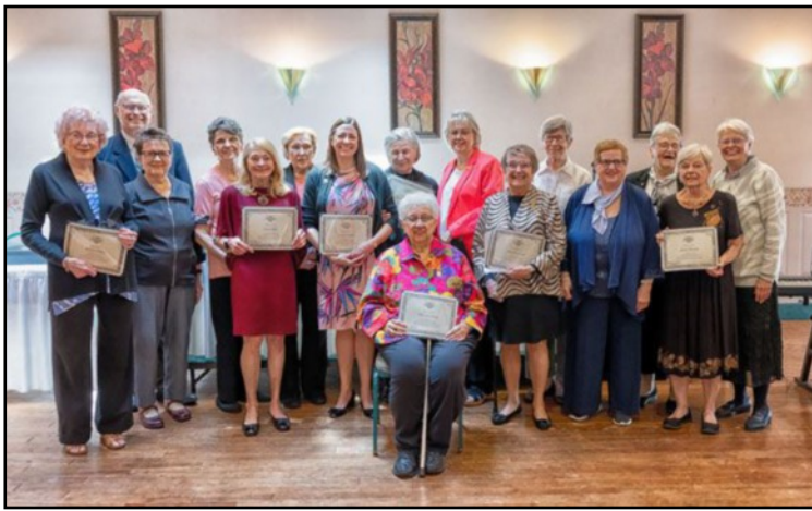
Members of Kalina Singing Society with special member-anniversary awards as they celebrate their 124 th Anniversary