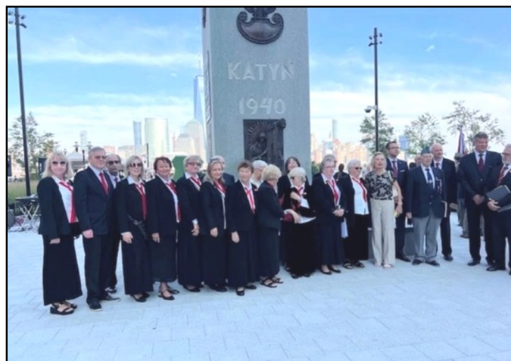
Aria Chorus at the Katyn Memorial Ceremony in New Jersey in September 2025.

Chopin Singing Society #182, Passaic, NJ participated on April 26 at West Point Military Academy with District 7 at the annual Kosciuszko Holy Mass Remembrance in Holy Trinity Chapel on the grounds, followed by the festivities/ceremonies inaugurating and unveiling the newly renovated column and refinished statue of Tadeusz Kosciuszko. On May 4, with District 7, Chopins sang at the Holy Mass at the Shrine of Our Lady