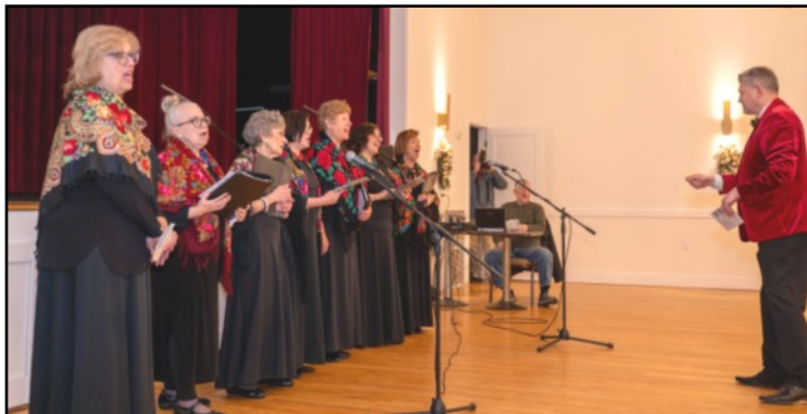
Marcella Kochańska-Sembrich Chorus