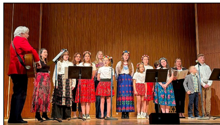
Polish Saturday School students perform in the Community Spotlight prior to Buffalo Philharmonic Orchestra's concert April 11, 2026

The Msgr. Peter Adamski Polish Saturday School Choir joined the ranks of the Polish Singers Alliance in November of 2024 under the auspices of the Chopin Singing Society #219. They have become a regular fixture at our District IX Festival of Carols and in October 2025 performed at the Chopin Singing Society's annual concert. As noted, for two seasons, they have performed in the Community Spotlight concert at